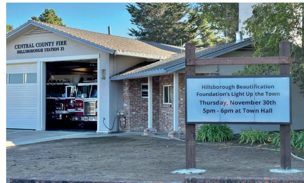
84" High Resolution Digital Public Signboard